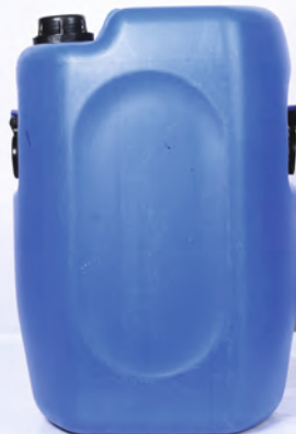
ROCKET - 50 Ltr

Height : 570 mm (+/-2%) Length : 400 mm (+/-2%) Width : 335 mm (+/-2%) Opening : 50 mm (+/-2%) Weight : 2.5 / 2.8 kg