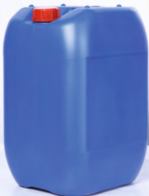
SQUARE CARBOY - 35 Ltr

Height : 472 mm (+/-2%) Length : 320 mm (+/-2%) Width : 285 mm (+/-2%) Opening : 44 mm (+/-2%) Weight : 1.8 / 2 / 2.2 kg