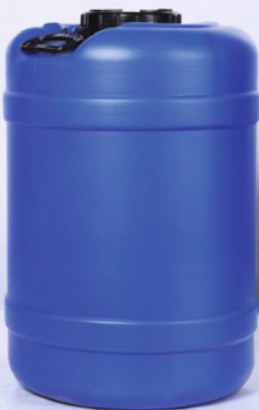
CWM - 50 Ltr

Height : 570 mm (+/-2%) Dia : 390 mm (+/-2%) Opening : 135 mm (+/-2%) Weight : 2.5 kg