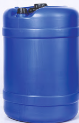
CNM - 50 Ltr

Height : 575 mm (+/-2%) Dia : 390 mm (+/-2%) Opening : 50mm, 30mm (+/-2%) Weight : 2.5 kg