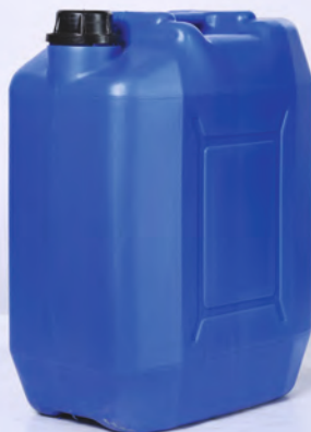
JERRY CAN - 35 Ltr

Height : 490 mm (+/-2%) Length : 380 mm (+/-2%) Width : 245 mm (+/-2%) Opening : 44 mm (+/-2%) Weight : 1.8 / 2 / 2.3 kg