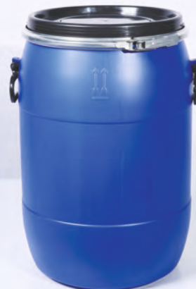
FOT - 50 Ltr

Height : 580 mm (+/-2%) Dia : 380 mm (+/-2%) Opening Dia : 315 mm (+/-2%) Weight : 2.5 kg